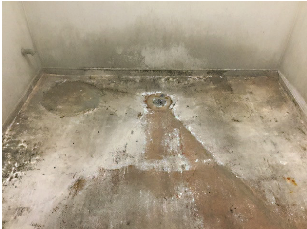
Preconstruction (wash down area before)