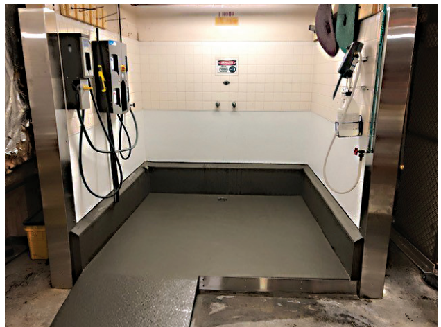
Finished Wash Down Area