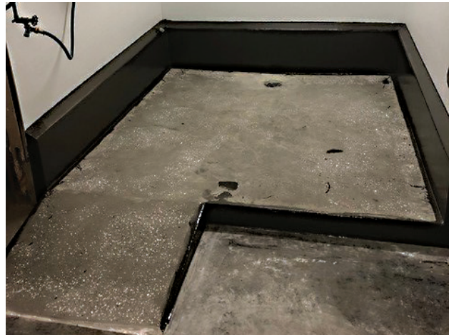
New FRP Panels & Curbing