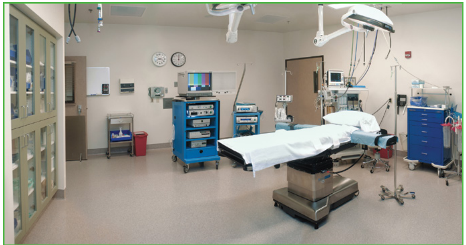
Non-porous, Stain-resistant, Easily cleanable, Slip-resistant.