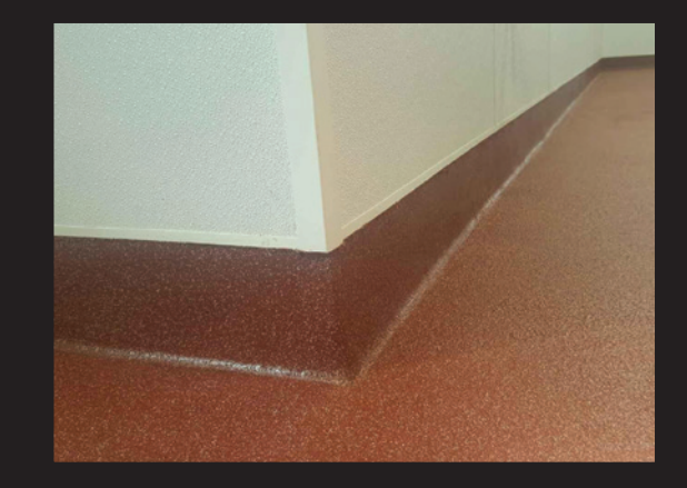
Integral 4" or 6" cove base creates a bathtub effect for effective waterproofing.

Contact us at sales@res-tek.net to find your local Regional Manager and customize a system that's right for you.