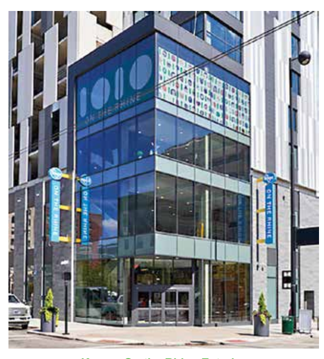
Kroger On the Rhine Exterior

"Res-Tek set us up with a coating system and a certified installer who understood our situation as well as our need to have the project completed quickly. We are very happy with the end results. The patio looks inviting to our guests and is much easier to keep clean."