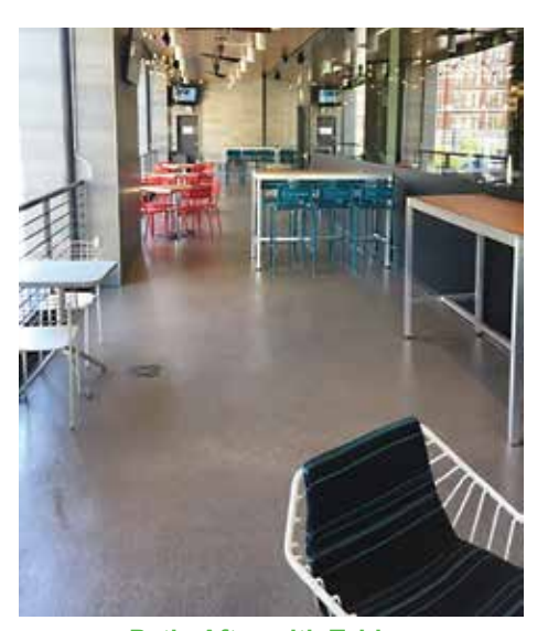
Patio After with Tables