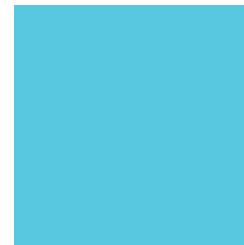
Sky Blue (LP-9)