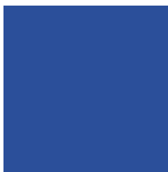
Royal Blue (LP-10)