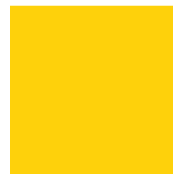
Safety Yellow (LP-12)